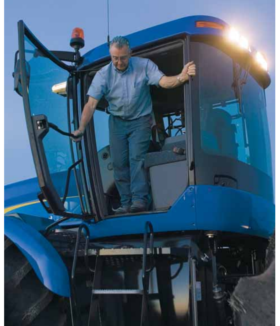
Convenient egress lighting lets you safely exit the cab while in a dark environment. Egress lighting is standard equipment on all T9000 models.